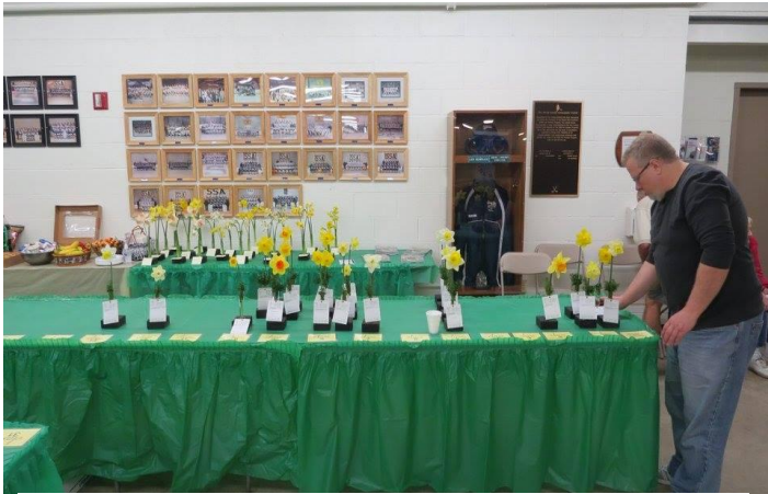
Mark Gresh at the 2015 Daffodil Show

7 is the Jonquilla and Apodanthus Daffodils that can have one to five flowers to a stem with the petals spreading or reflexed. Foliage is often reed like or very narrow and dark green. Most like a hot baking summer sun and do well in pots. They have a sweet fragrance that can act as a natural air freshener.